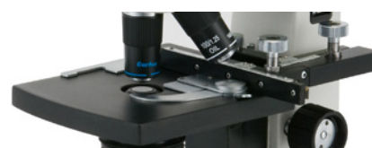
Mechanical Stage on CJ-10