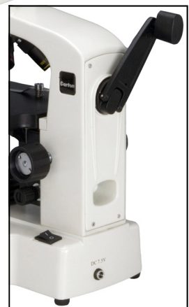
Built-in power generator